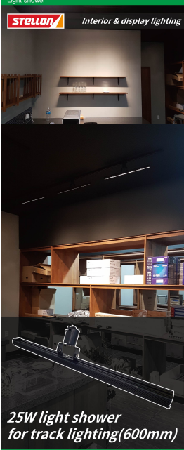
25W light shower for track lighting