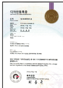
[Floodlight patent of design]