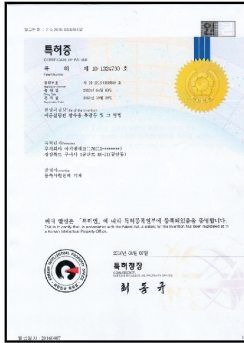
[Double-sealed waterproof floodlight and method for same]