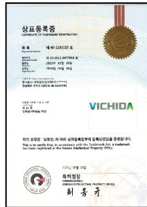
[VICHIDA patent of brand]