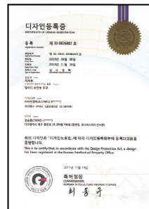
[Street light patent of design]