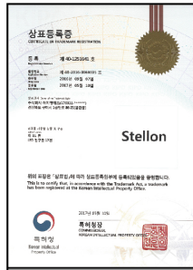
[Stellon patent of brand]