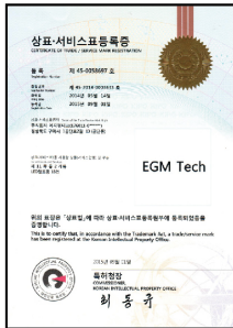
[EGM Tech patent of brand]