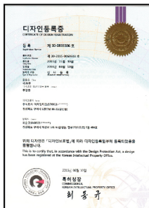
[Floodlight patent of design]