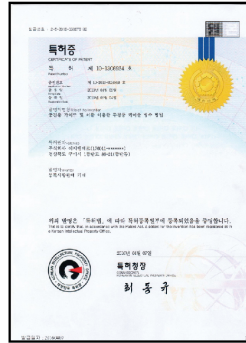
[Filling Silicon for airtight light waterproof of cabel registered]