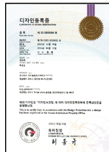
[Floodlight patent of design]